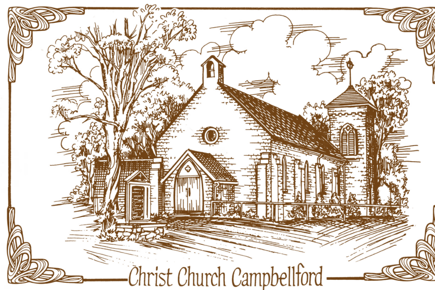
Christ Church Campbellford

Following the Service there will be a potluck lunch. Please bring something to share.